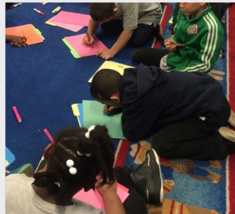
Above: CS111Q's School Year 2016-2017 2nd graders working on their poetic writing

Last year, CWP worked with CS 111Q's 1st and 2nd grade classrooms to make their own anthologies, which they received after the 12-14 week program concluded. Anthologies are booklets comprised of stories and poems written by the scholars of their work done within the program. This year, Community-Word Project will continue developing writing with 1st and 2nd graders to further develop their story telling skills and love of theater expressions from their previous residency experience.