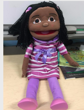
Class puppet at PS 171Q

Students take part in a 14-week curriculum called "The Friends School" that concentrates on social, emotional and behavioral skills of the child and peers. Each week focuses on teaching students about healthy interaction and communication skills with peers. Students interact with a puppet to practice mutual respect.